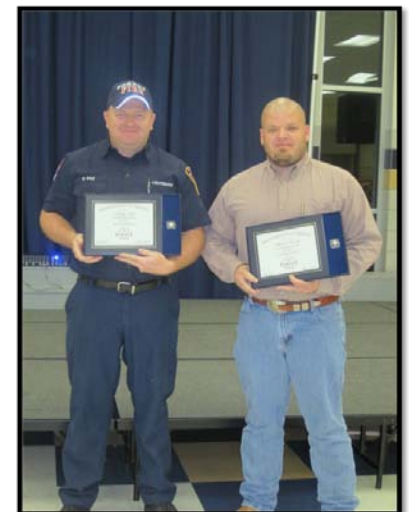
Ten Year Employees

Thank You for your Service and Commitment to the City.