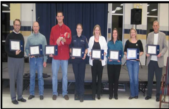
Five Year Employees