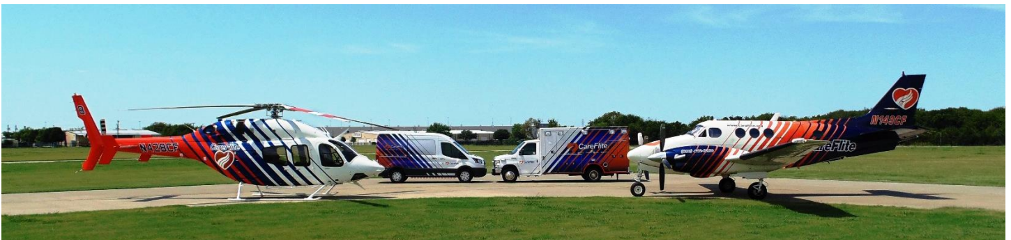
CareFlite: America's Oldest Joint Use Air Medical Service, America's Youngest EMS Helicopter Fleet

CareFlite will be offering free CPR training during 2017. Visit CareFlite.org or CityofForney.org for more information.