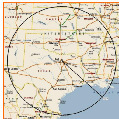
Fixed Wing Air Ambulance Service